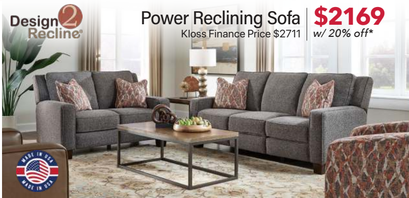
Design 2 Recline Power Reclining Sofa $2169 Kloss Finance Price $2711 | w/ 20% off*

The largest leather selection in the St. Louis area!