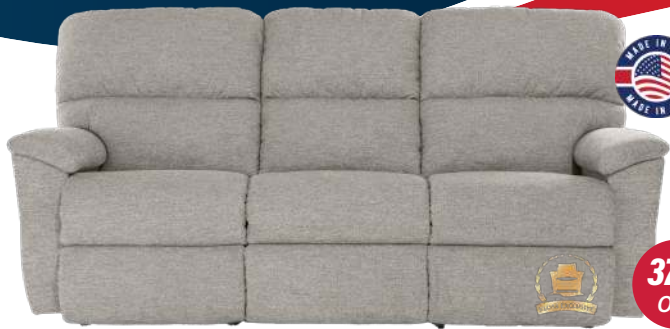
La-Z-Boy Custom Reclining Sofa $996 Kloss Finance Price $1599 | Exclusive Buy*