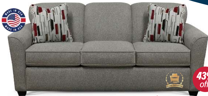
England Custom Sofa $996 Kloss Finance Price $1759 | Exclusive Buy*