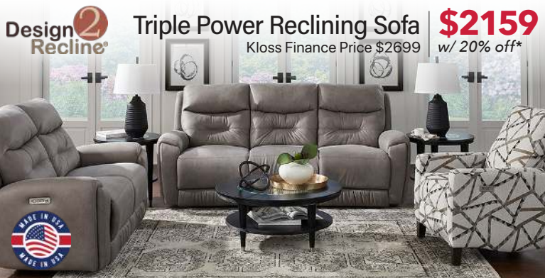
Design 2 Recline Triple Power Reclining Sofa $2159 Kloss Finance Price $2699 | w/ 20% off*