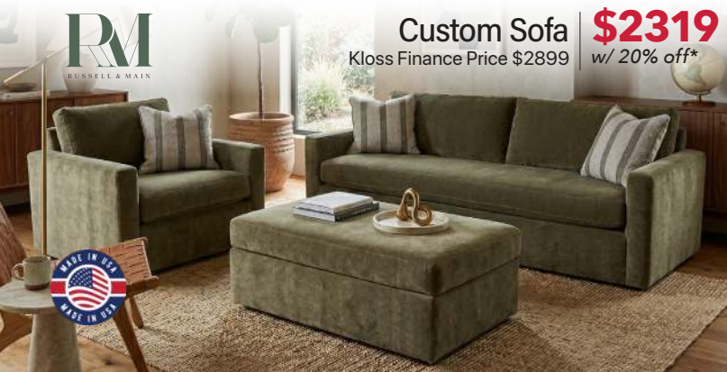
RM Custom Sofa $2319 Kloss Finance Price $2899 | w/ 20% off*

The largest leather selection in the St. Louis area!