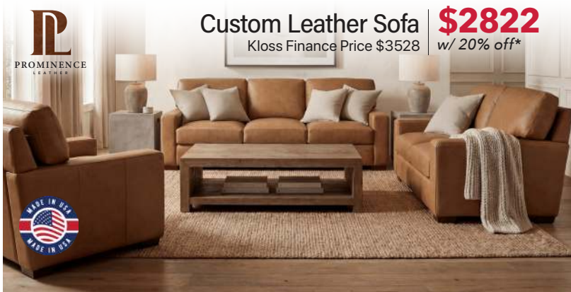
PROMINENCE Custom Leather Sofa $2822 Kloss Finance Price $3528 | w/ 20% off*